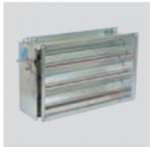
IJK Damper. Supplied with standard rectangular flanges. Manufactured from galvanised sheet steel. Fitted as standard with removable handle. Shaft diameter: 10 mm. As accessory: electrical damper actuator LM230A.

For more information see the mounting accessories for direct air fans, behind ILT serie.