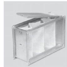
IFL G4 In-line duct bag filter.