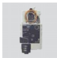
LM-230A Electrical damper actuator.