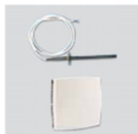
TG-K330 Duct temperature sensor. TG-R530 Room temperature sensor.

For more information see electrical accessories.