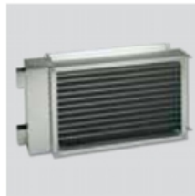
IBW Hot water coil.