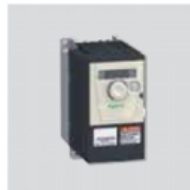
VFTM IP21 Adjustable frequency drive for three phase motors.