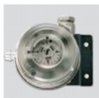
DPS 2-30 DPS 10-100 Differential pressure switches: - DPS 2-30: from 20Pa to 300Pa. - DPS 10-100: from 100Pa to 1000Pa.