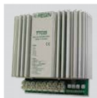
TTC-40F + TTS-4 Three phase electric heater controller. The TTC-40F needs an external temperature sensor to control the heater (TG-K300 or TG-R530).