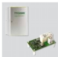
TTC-2000 TTC-2000 + TTS-1 Three phase electric heater controller. The TTC-2000 needs an external temperature sensor to control the heater (TG-K300 or TG-R530).