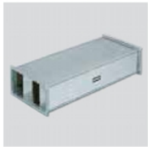
IAA Acoustic attenuator.