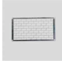
DEF Rectangular protection guard.