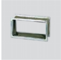
IAE Rectangular flexible connector.