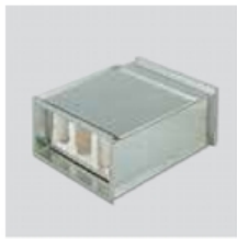
IFL In-line duct bag filter.