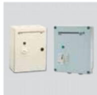
RMB/RMT Fan speed controllers.