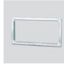
IBR Rectangular duct flange.