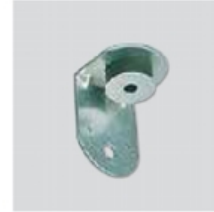
ISA Anti-vibration mounting. (1 ISA = 4 supports)