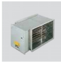
IBE Electric heater.