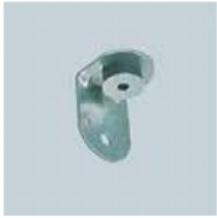
ISA Anti-vibration mounting. 1 ISA = 4 supports.