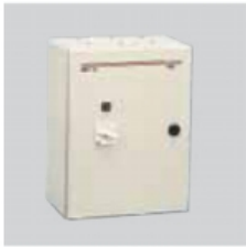
RMB/RMT Three phase speed controller.

NOTE: The following accessories are certified for use with the equipment. For that reason, they cannot be substituted with any other type or brand of accessory.