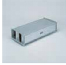
IAA Sound Attenuators Designed to reduce in-duct sound levels. All models are designed in 1m length.