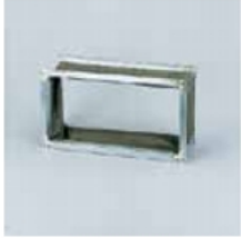
IAE EX Rectangular flexible connector.