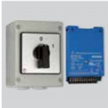
Protection system for the motor MSK EX Set comprising a protection relay in combination with a circuit breaker. For 400V three-phase motors with PTC.

For more information see Electrical accessories.