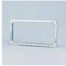
IBR Rectangular duct flange.