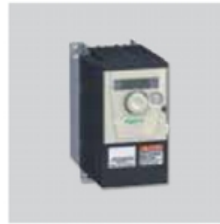
VFTM IP21 Adjustable frequency drives.