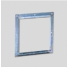
Outlet flange CBM